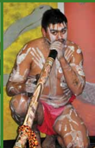
HALO dancers accompanied by expert didgeridoo player