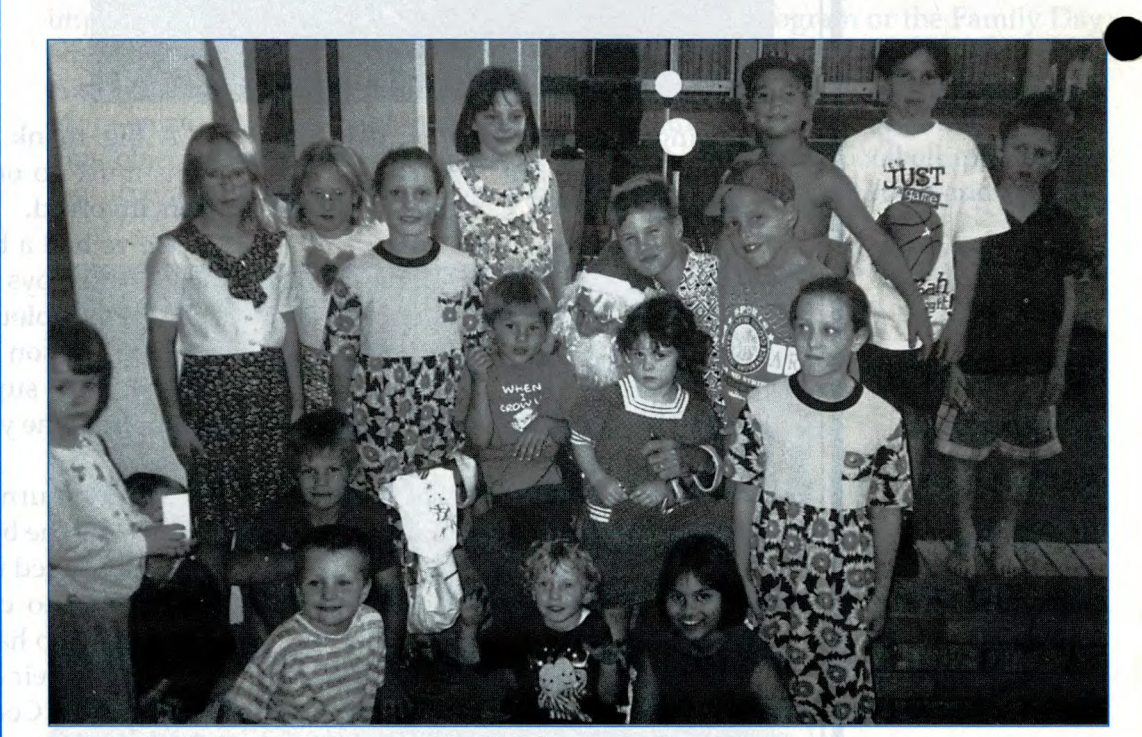
Father Christmas had his hands full chatting with the many children in attendance.