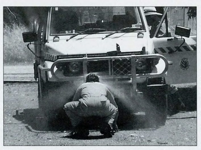
Volunteer Emergency Service workers at the scene of a recent bushfire

One of the volunteers found a novel way to cool down.