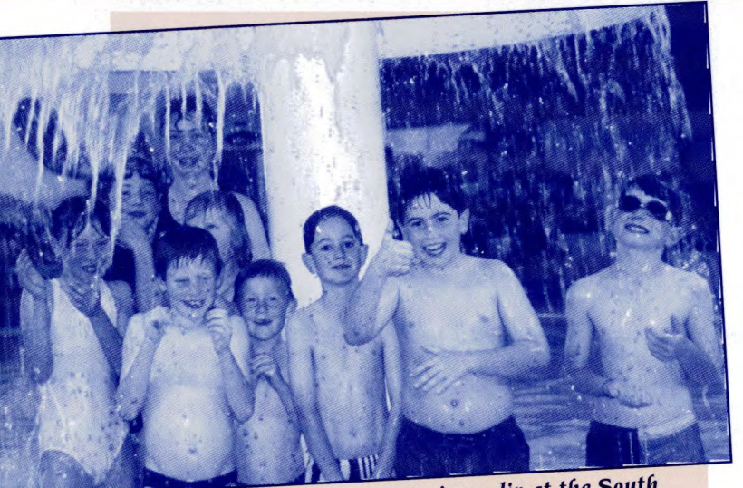
Incentive Scheme participants enjoy a dip at the South Lakes Leisure Centre

In July 1996 the South Lake Leisure Centre introduced an incentive scheme to encourage children to remain in the Swim School programs. The incentive scheme had a two-year life span and proved a great success.