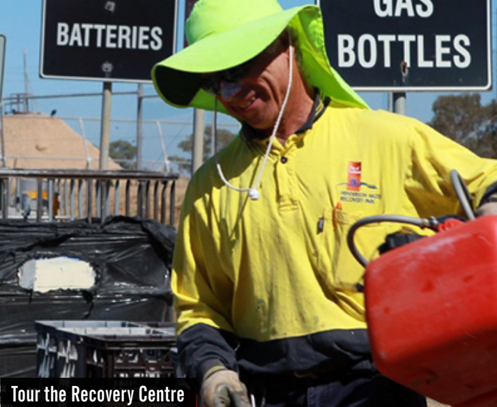
Tour the Recovery Centre