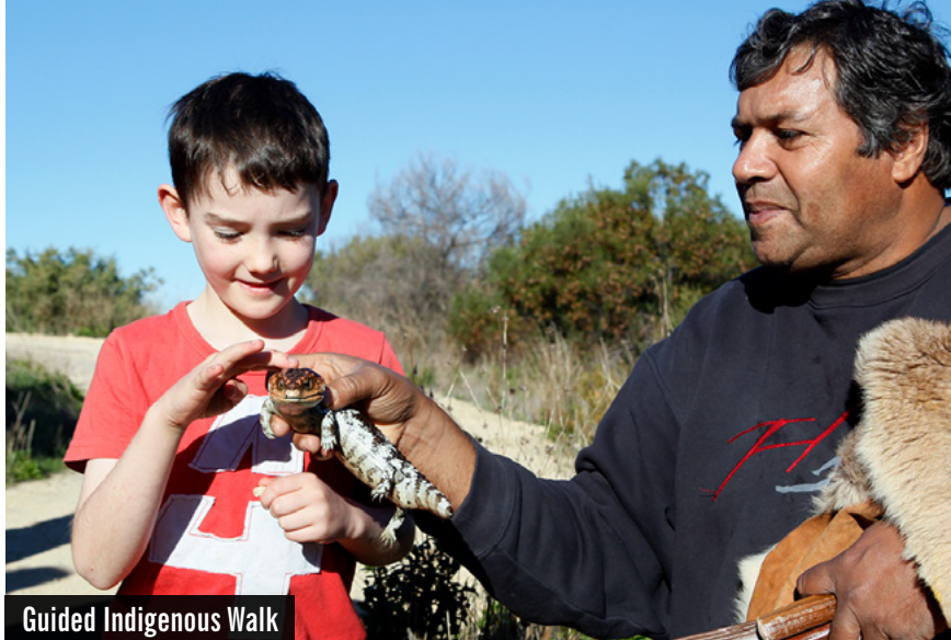
Guided Indigenous Walk