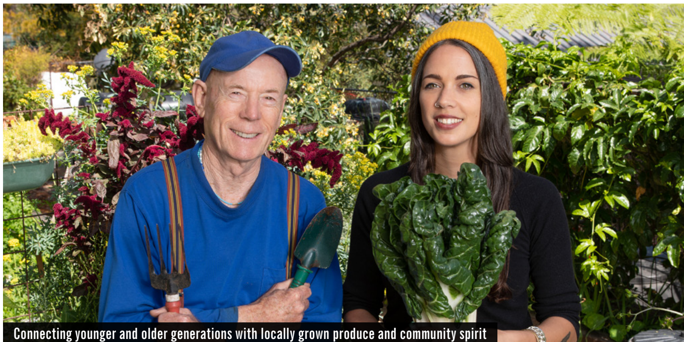
Connecting younger and older generations with locally grown produce and community spirit