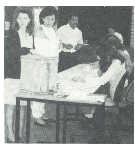
Voting at the May elections.

At the first Meeting of Council after the Elections, Councillors elect the Mayor and Deputy Mayor for the year.