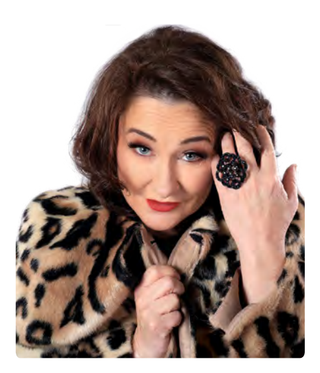
On the cover

Aussie favourite Fiona O'Loughlin headlines Side Splitter