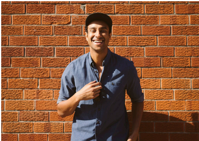
Join Matt Okine along with other well-known comedy personalities