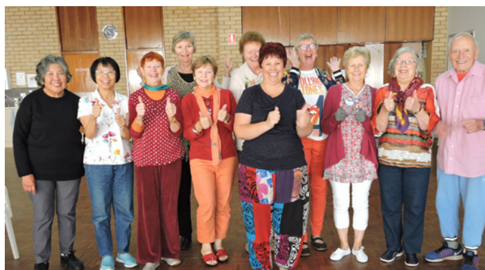
It's a thumbs up for laughter sessions at Cockburn Seniors Centre

Enjoy a delicious two-course meal on Mondays, Wednesdays and Fridays at 12pm. Bookings essential by calling 08 9411 3877.