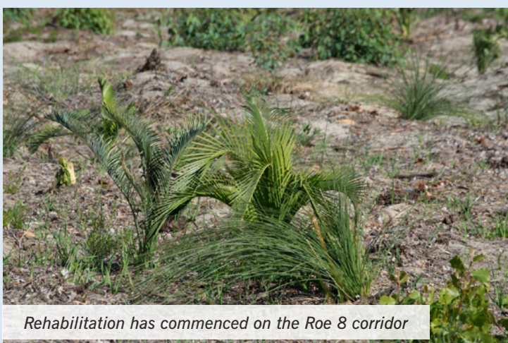
Rehabilitation has commenced on the Roe 8 corridor

For more information on the rehabilitation works, visit rehabilitatingroe8.org