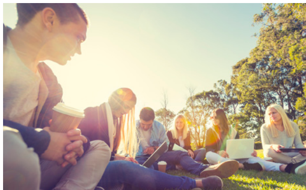
Enjoy free WiFi in more locations around Cockburn

For more information, visit cockburn.wa.gov.au/wifi