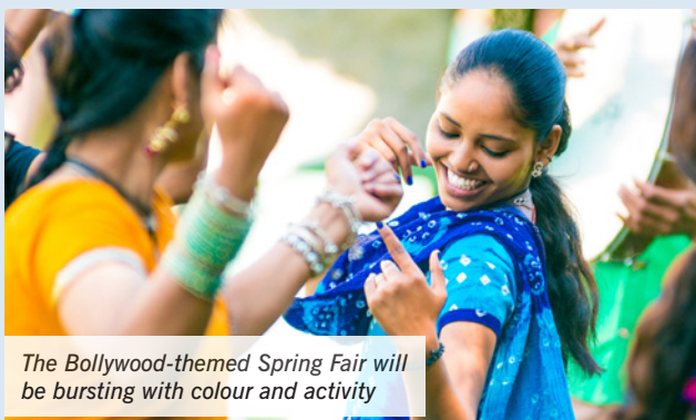
The Bollywood-themed Spring Fair will be bursting with colour and activity

The 2017 Spring Fair is Bollywood themed and will be bursting with colour and entertainment.