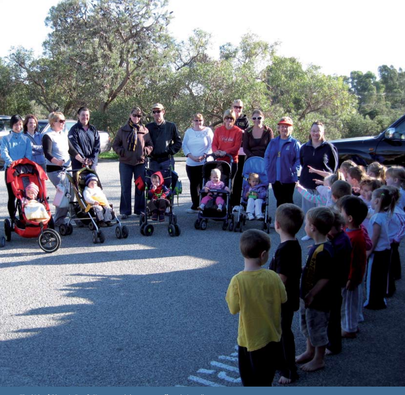
The kids of Olympic Fun & Fitness send the parents off on their walk.