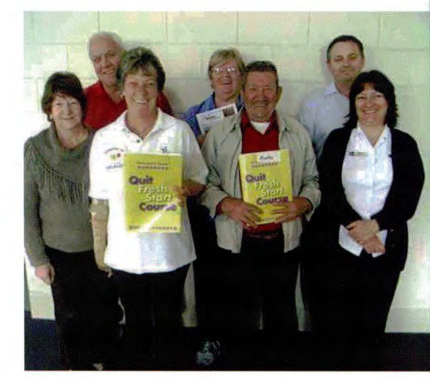
Above: Course participants

The City offers support to residents hoping to quit smoking. To ask about the Fresh Start course, run by Cancer Council-trained City staff, contact our health officers Sue Judd and Gilly Street on 9411 3589.